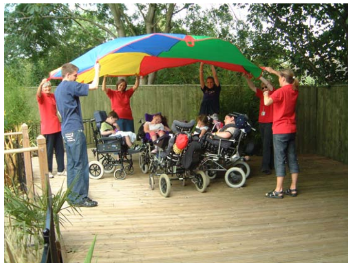
James Hopkins Trust: £5,000 grant to support the provision of care.